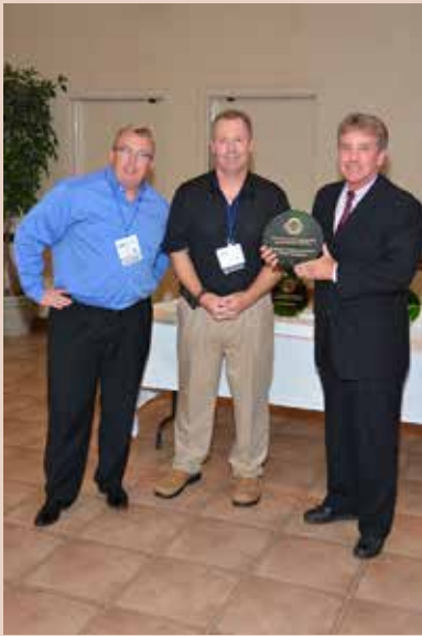
CORPORATE RECYCLER OF THE YEAR Holiday Inn Conference Center/O'Reilly Hospitality Little Rock