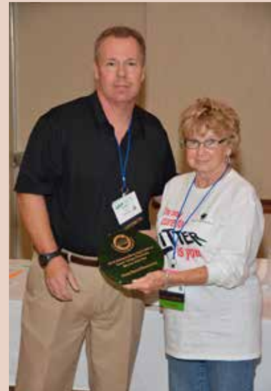
SCHOOL/COLLEGE/UNIVERSITY RECYCLER OF THE YEAR Daisy Bates Elementary Little Rock