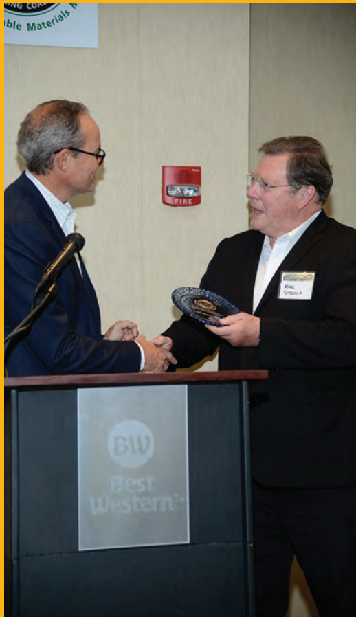
Recycling Education Program of the Year Regional Recycling & Waste Reduction District – Pulaski County