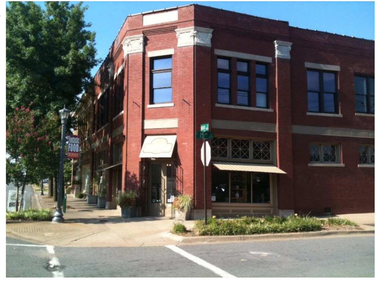
C.H. Dawson Drug Store opened in 1905