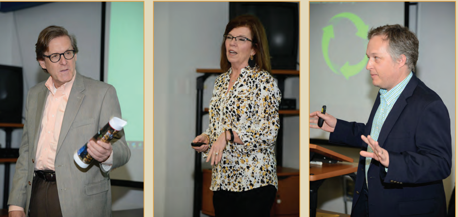
Arkansas Department of Career & Technical Education