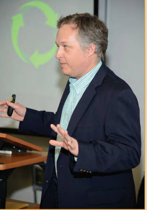
eSCO Processing & Recycling