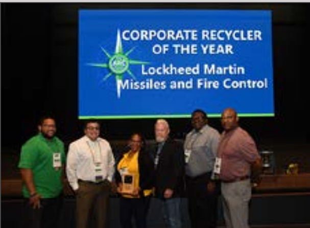
Corporate Recycler of the Year Lockheed Martin Missiles & Fire Control