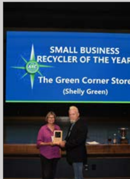
Small Business Recycler of the Year The Green Corner Store