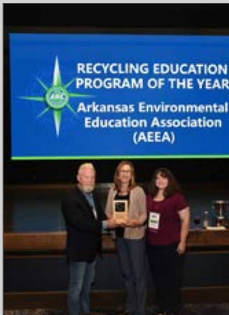
Recycling Education Program of the Year Arkansas Environmental Education Assn. (AEEA)