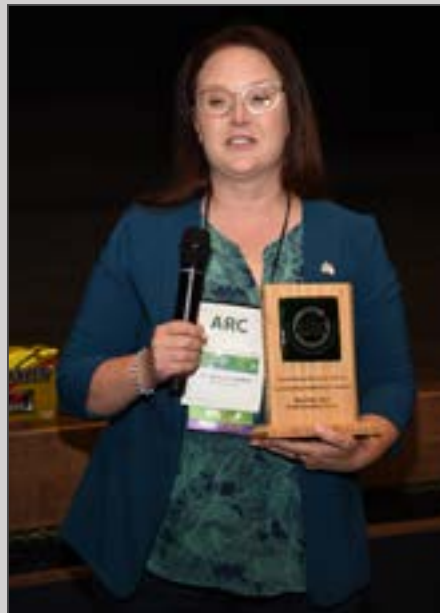
Community Involvement Program of the Year Big River Steel Environmental Team