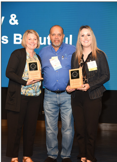
Recycling Education Program of the Year Trex Company and Keep Arkansas Beautiful