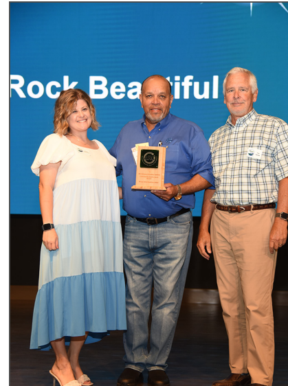
Community Involvement Award Keep little Rock Beautiful