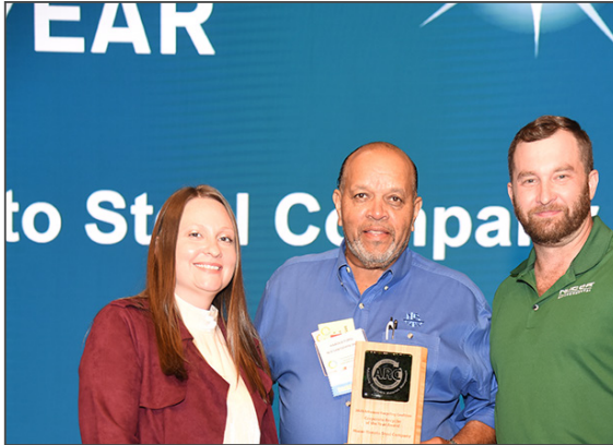
Corporate Recycler of the Year Nucor-Yamato Steel Company