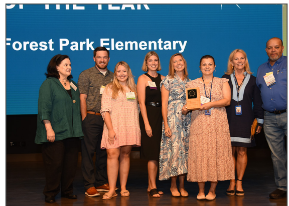
School Recycler of the Year Forest Park Elementary