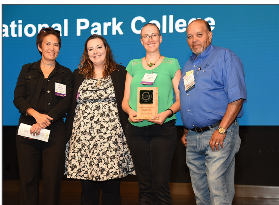
College Recycler of the Year National Park College